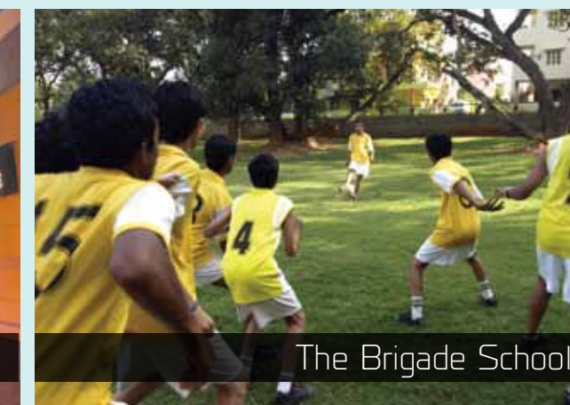
The Brigade School