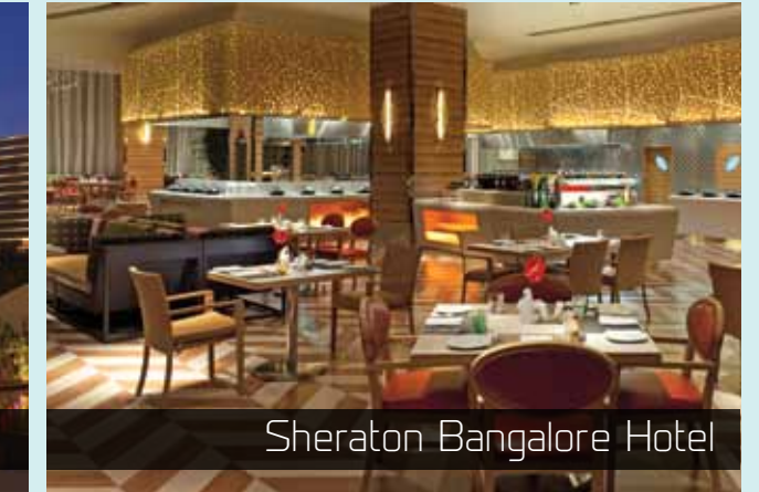
Sheraton Bangalore Hotel