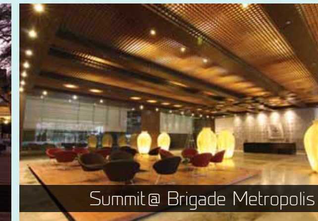
Summit@ Brigade Metropolis