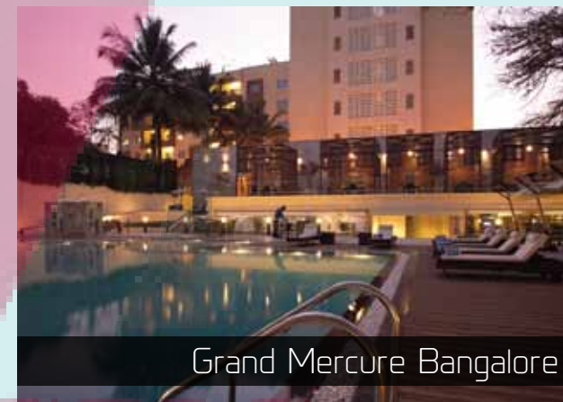
Grand Mercure Bangalore