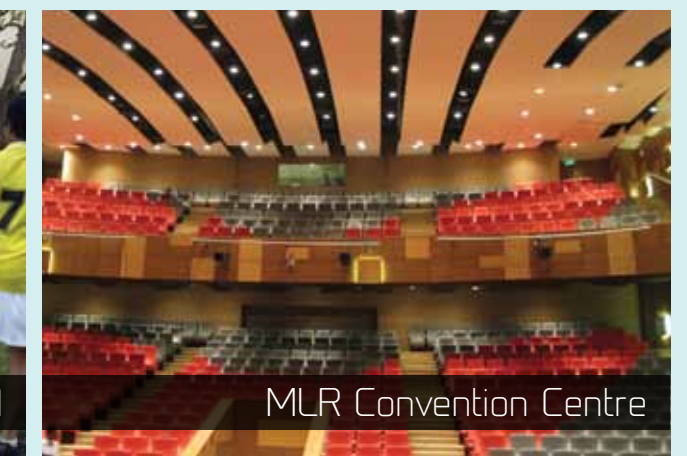
MLR Convention Centre